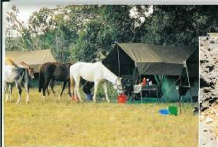
(Above) A back-up team ensures that the camp is always ready for weary horses and riders (Right) A boulder or cow-elephant?