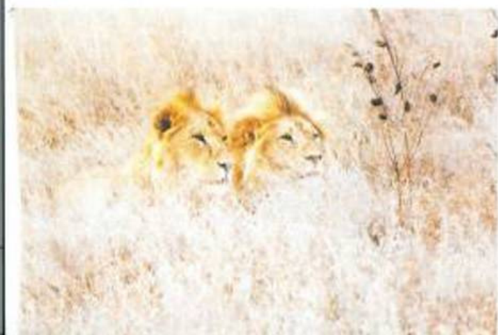
(Below) On horseback, you become part of the animal kingdom, not an item on the menu

Wild and Exotic: 01439 748401; fax: 01139 748387; e-mail: info@wildandexotic.co.uk; www.wildandexotic.co.uk