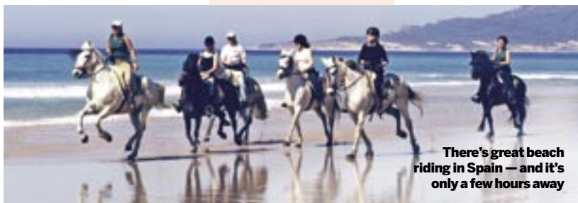
There's great beach riding in Spain — and it's only a few hours away