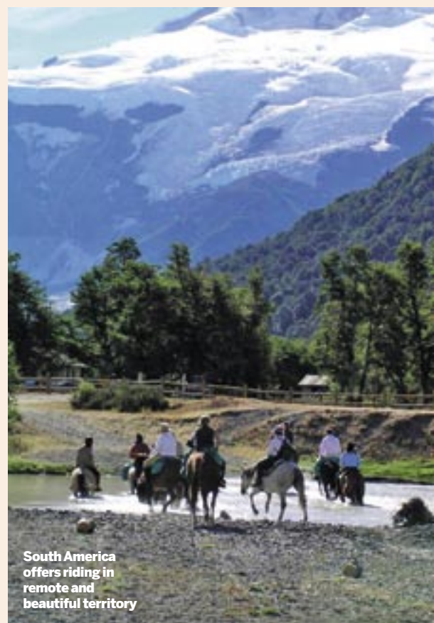
South America offers riding in remote and beautiful territory

material. One of his most memorable trips was to the Okavango Delta. “It was extraordinary — there is no horizon, the terrain just goes on and on.”