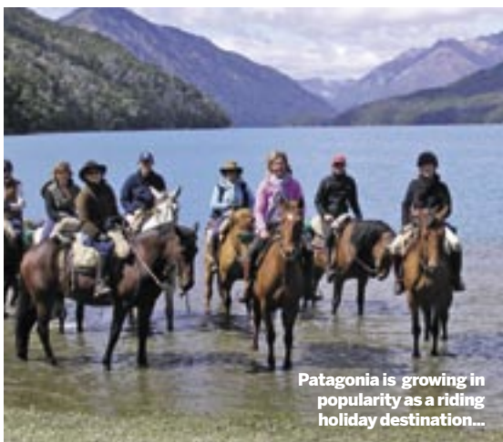
Patagonia is growing in popularity as a riding holiday destination...

Thinking about a riding holiday? Caroline Bankes asked the equi-trip cognoscenti to share their insight on the best venues, value and how to prepare for the trip of a lifetime